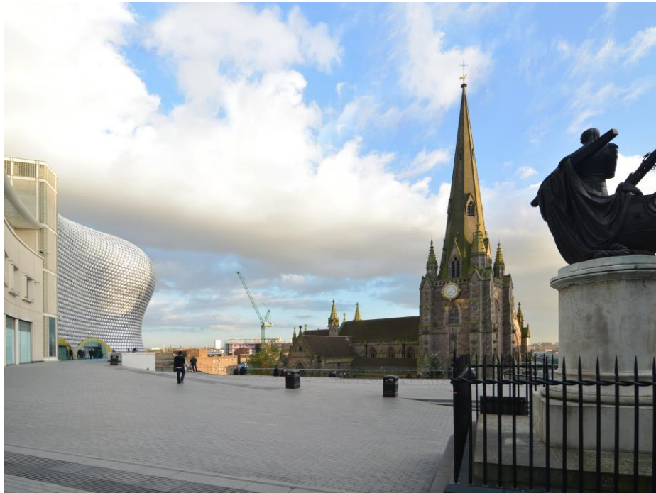
View as existing