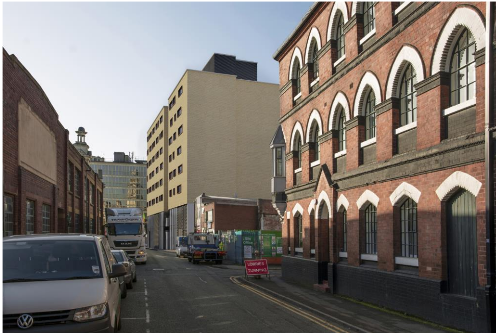
View as existing

L5: Allison Street - opposite the RTP Crisp building