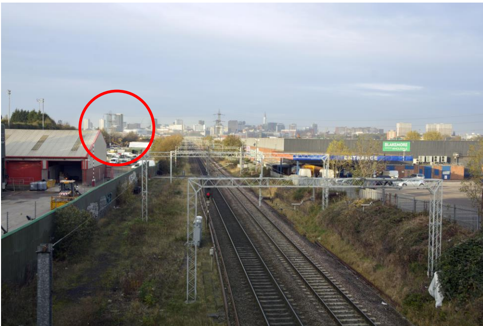
View as proposed