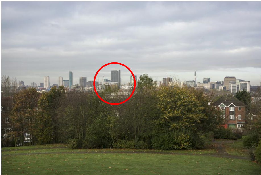
View as proposed