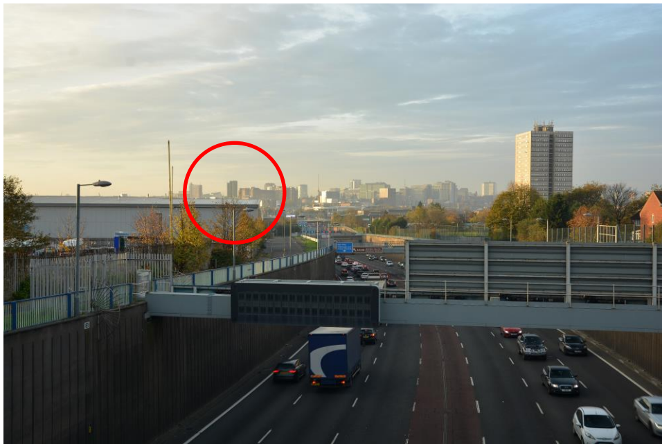
View as proposed