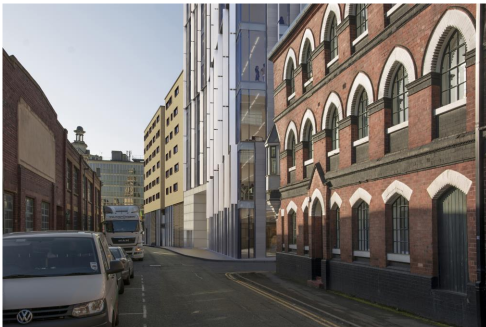
View as proposed