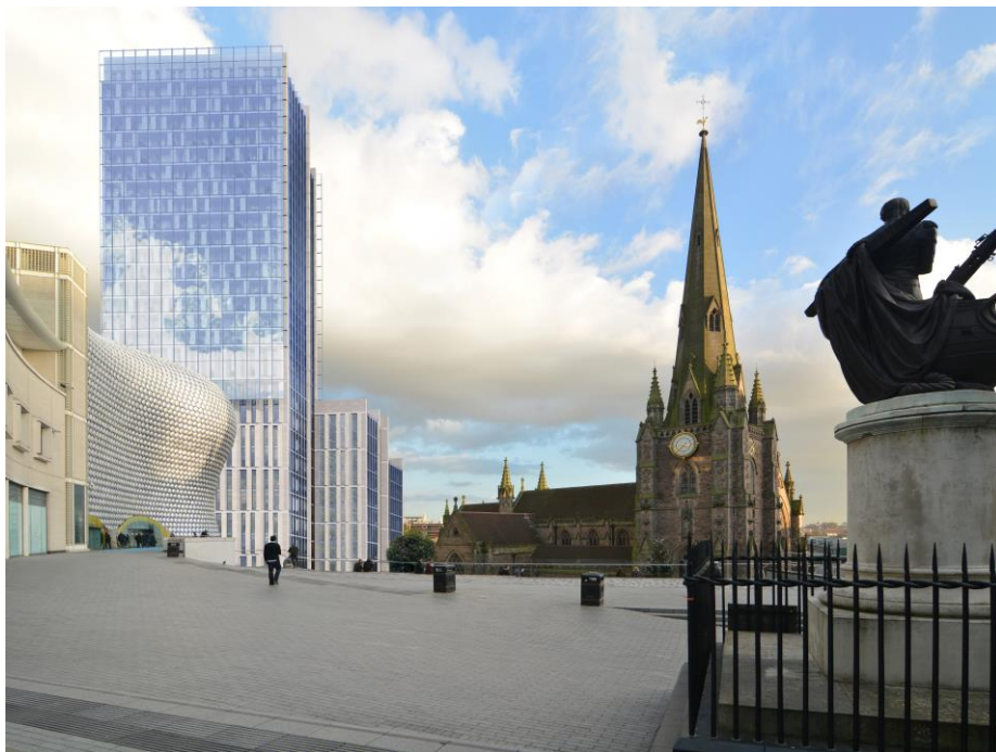
View as proposed