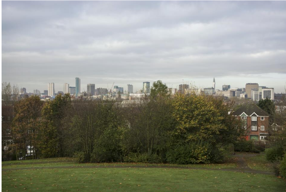
View as existing