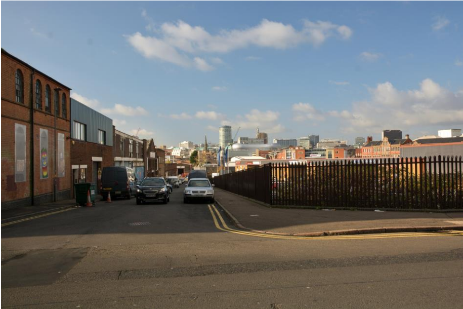
View as existing