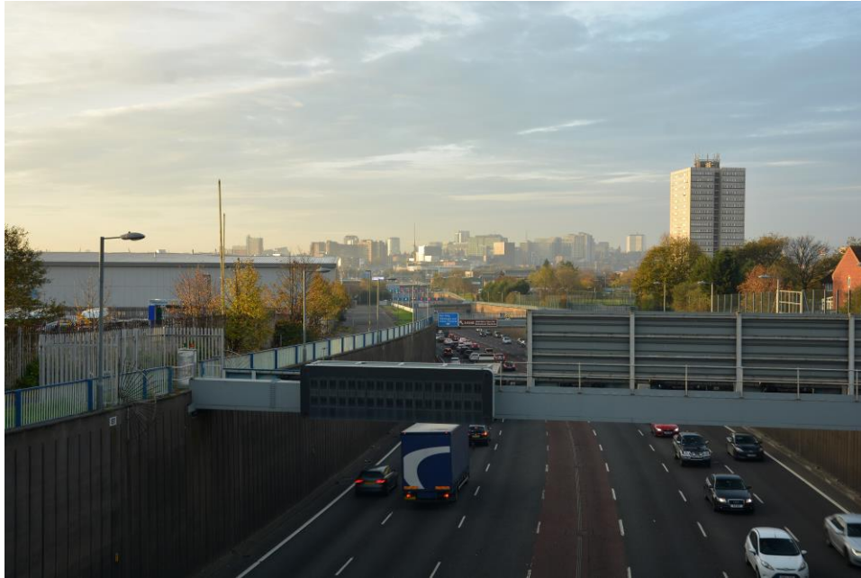
View as existing