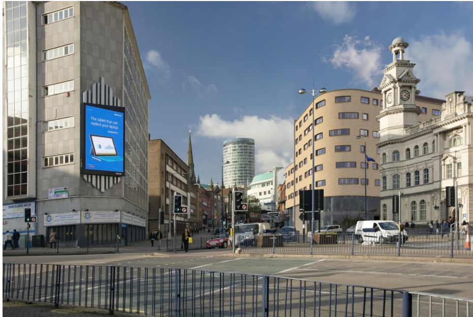
View as existing