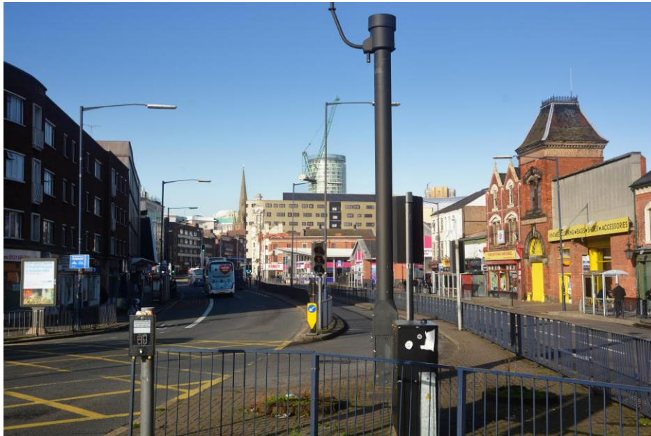
View as existing