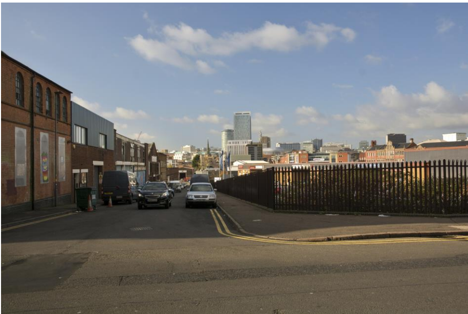
View as proposed