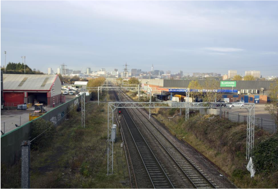
View as existing

D2: Bordesley Green Road crosses the West Coast Rail Line beside Adderley Park Station