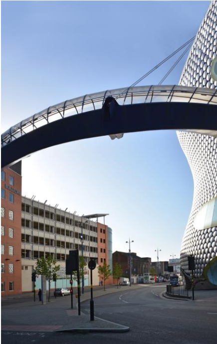
View as existing

L4: Park Street - pedestrian crossing outside Selfridges