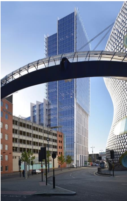
View as proposed