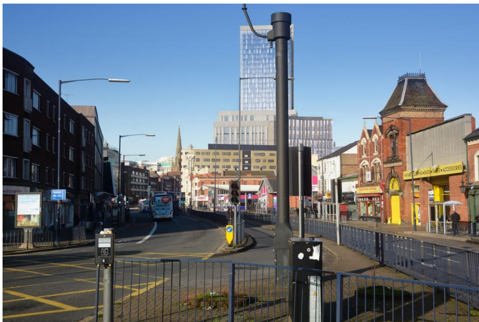
View as proposed